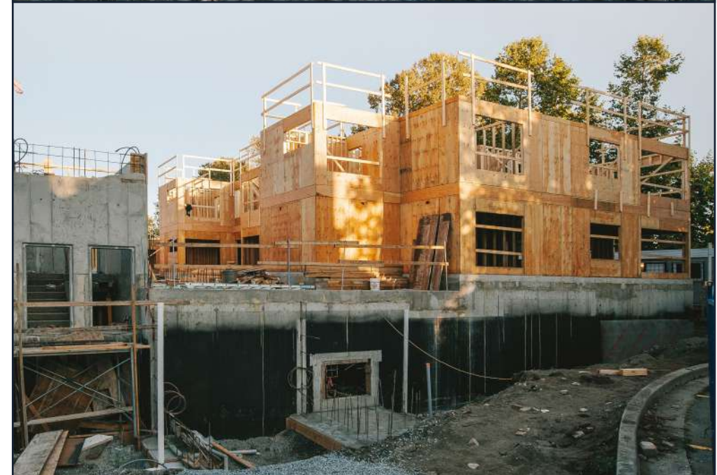
Vancouver Community Land Trust Foundation Construction Site