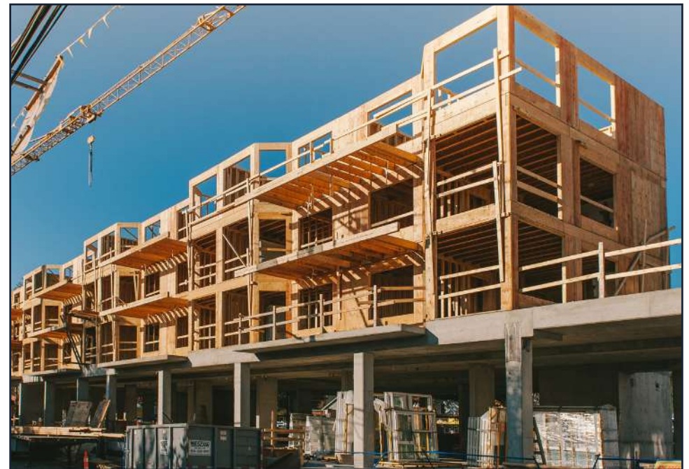
Vancouver Community Land Trust Foundation Construction Site